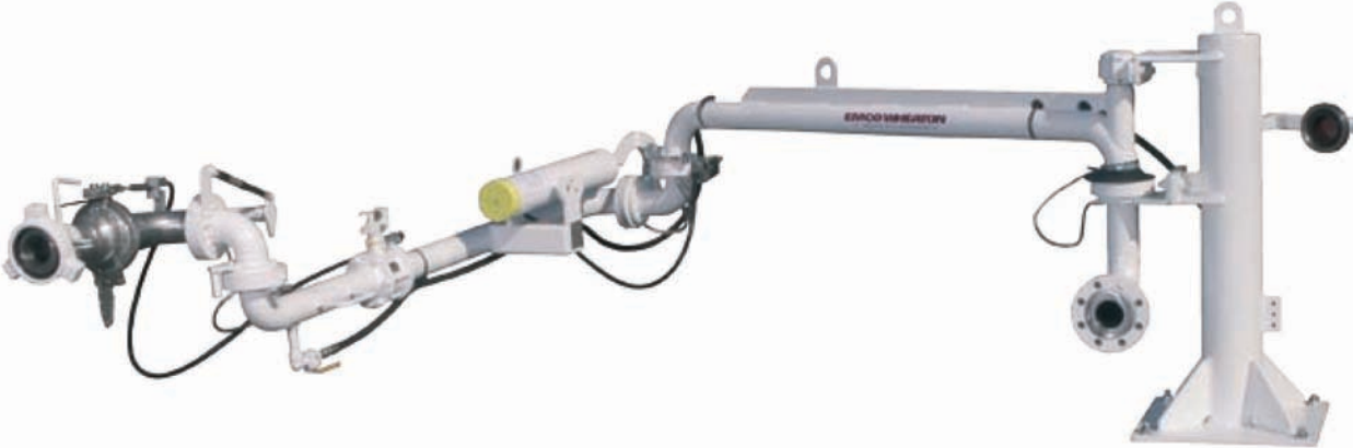
Shown design with emergency release system

Bottom transfer loaders provide extended reach that makes them ideal for applications where a vehicle cannot be accurately spotted.