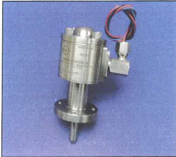
MEI DETECTOR WITH SINGLE SWITCH