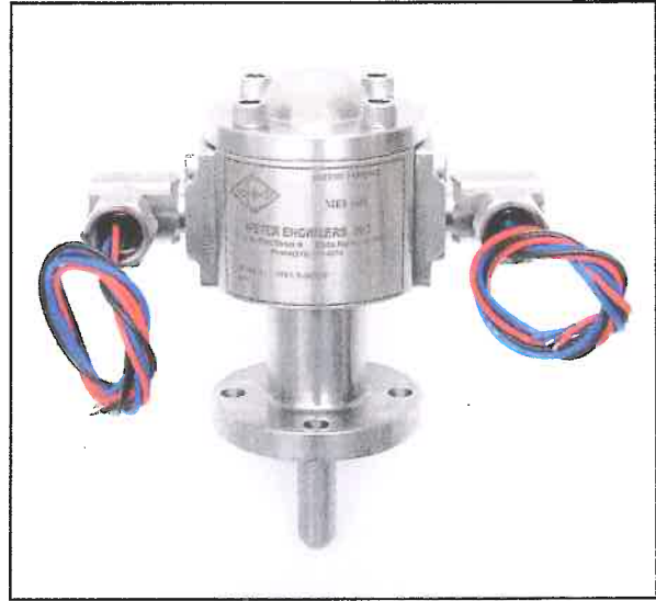
MEI DETECTOR WITH DOUBLE SWITCHES